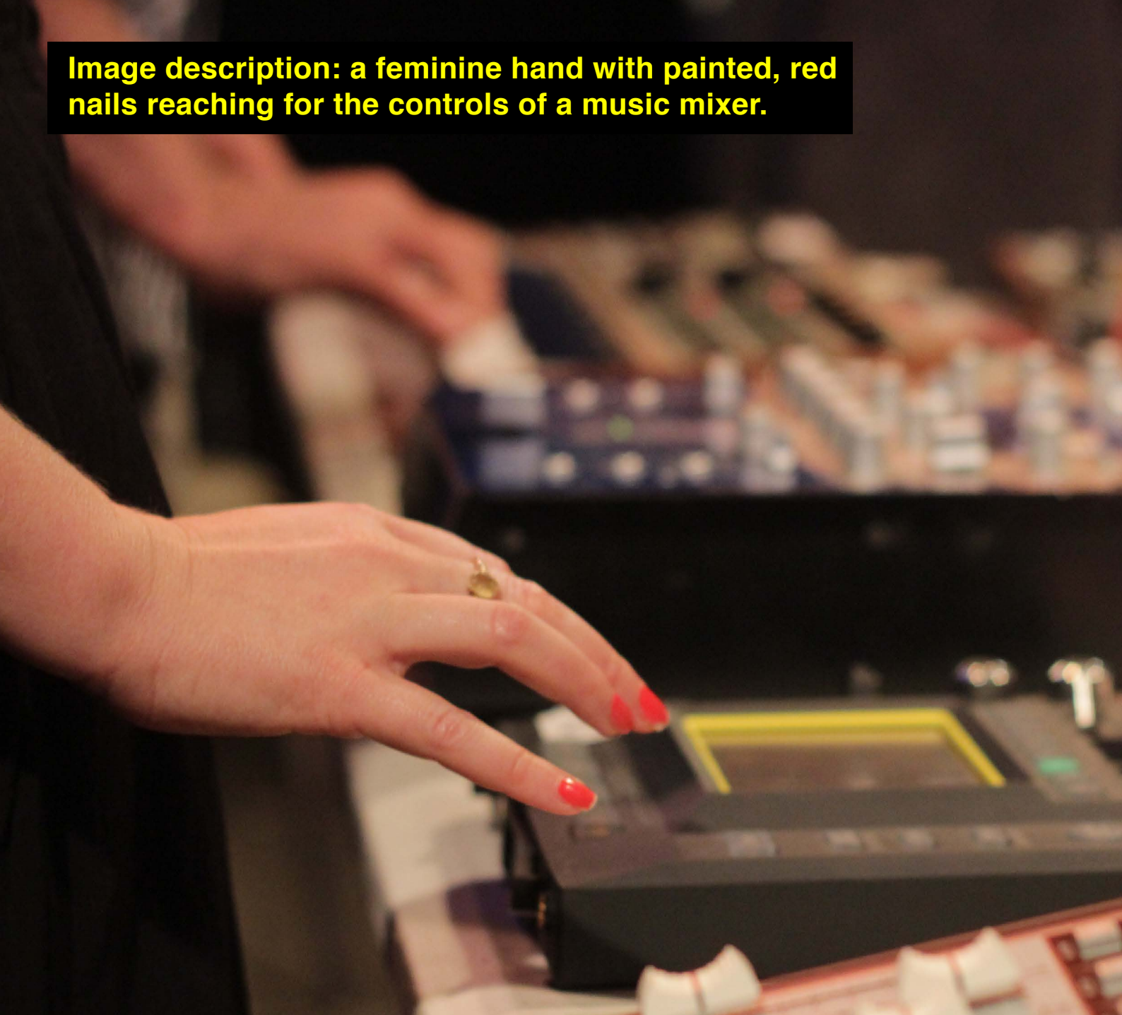
Image description: a feminine hand with painted, red nails reaching for the controls of a music mixer.