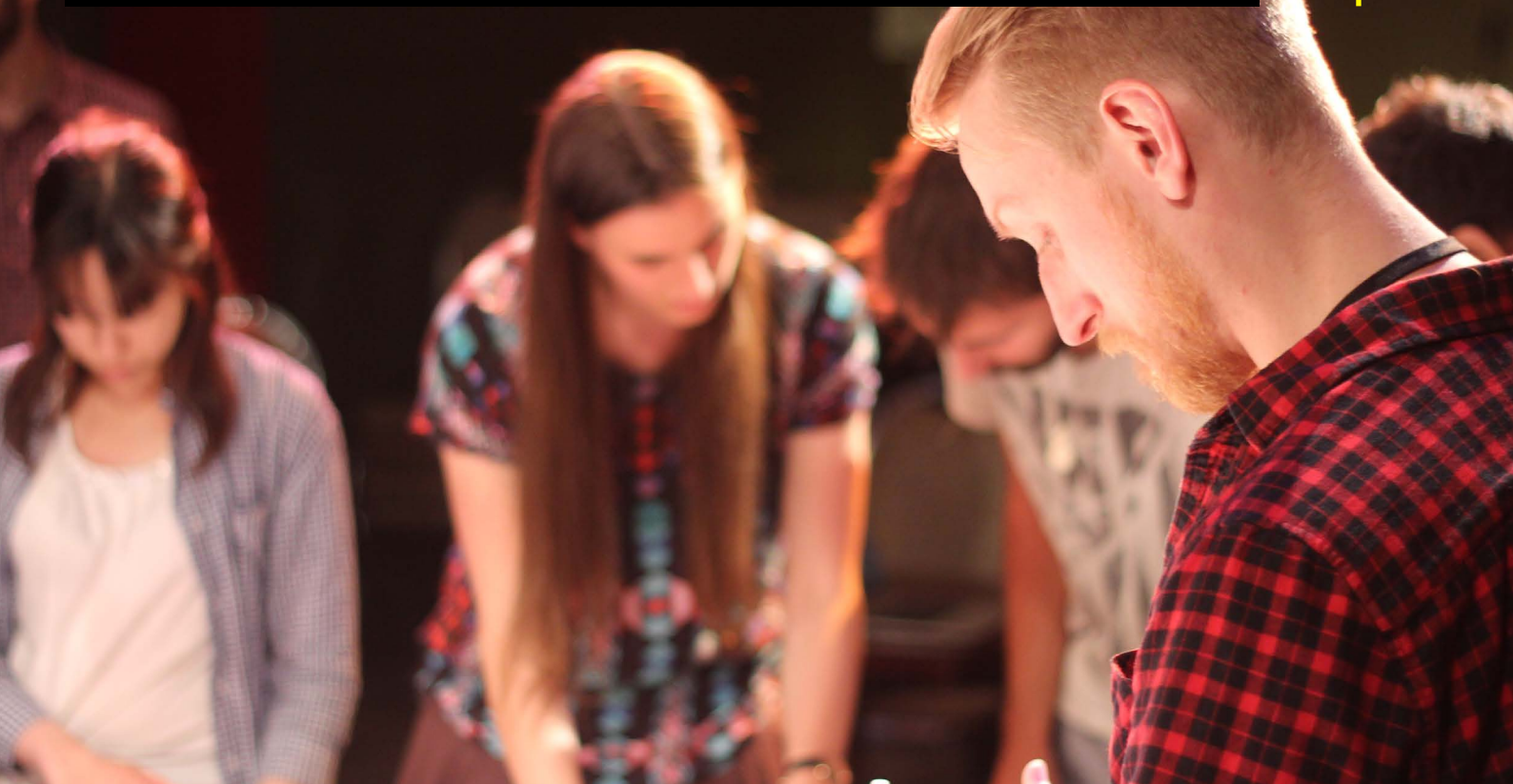
Image description: Forming a circle, people work together and individually on a range of music equipment.

For further information or to email a CV of your experience and examples of your work, please contact Liz Martin at hacksounds@107.org.au